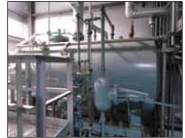
Cleaver-Brooks Spraymaster Deaerator

The key to faster startup is that the Engineered Boiler Systems package produces optimal quality steam for the turbine sealing process using its D-type IWT design, advanced C-B NATCOM burner and Cleaver-Brooks Spraymaster deaerator. Nebraska Public Power District benefits because the C-B Nebraska Boiler, C-B NATCOM burner, Cleaver-Brooks deaerator, and the Rockwell Automation (Allen-Bradley) PLC-based boiler and burner control are all manufactured and/or integrated by a single supplier, giving NPPD a single source for service, maintenance, upgrades and support.